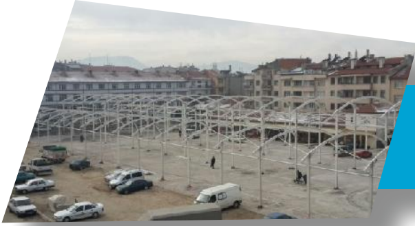
Konya Beyşehir 4.000 m2 Closed Market Area Construction