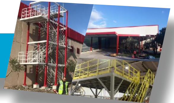
Vestel Manisa Osb Factory Steel Construction Works