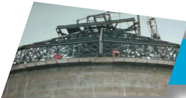
Cimentas Bornova Steel Construction Clinker Silo Roof Construction