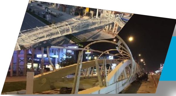
Denizli Pamukkale University, Steel Construction Pedestrian Overpass Construction