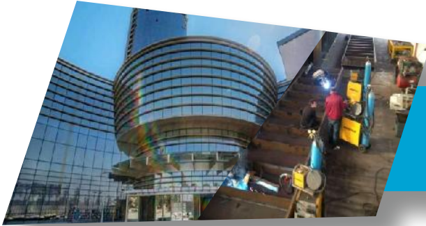
Iraq Baghdad Mall Hotel and Hospital Complex, Steel Structure Roof Beams Over Conference Hall Construction