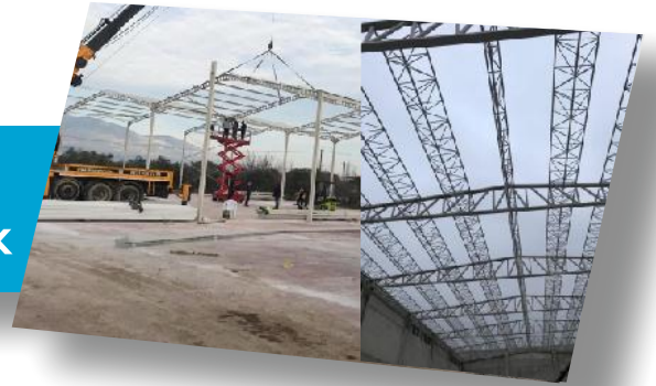
İzmir Kemalpaşa Steel Construction Warehouse and Factory Construction Work