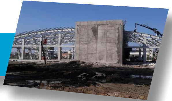
Aydin Cine Wedding Hall