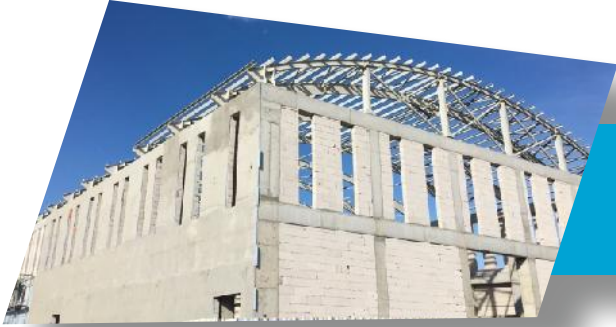
Denizli Dokuzkavaklar Swimming Pool