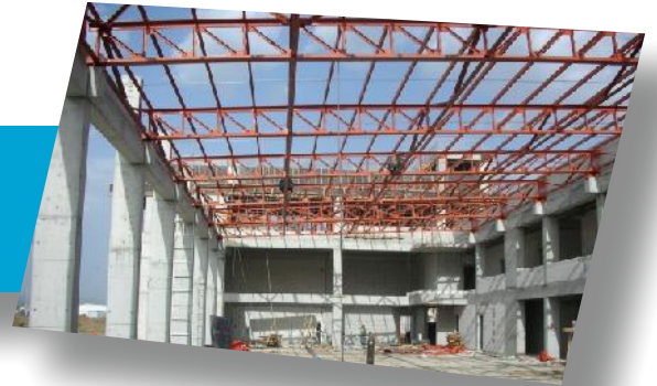
Usak and Adiyaman Airports Steel Construction Warehouse, Hangar, Fire and Garage Buildings Construction