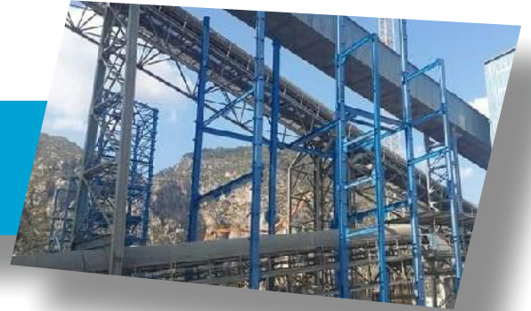
Batisöke Cement Factory Steel Construction Roller Press Plant - 950 Ton