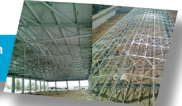
Malatya Çakma Kışlası Steel Construction of 100 Vehicles Garage Construction