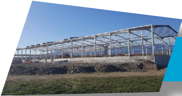
Baęyurdu Efkar 6.000 m2 Steel Construction Meat Combined Plant