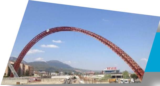
Alparslan Türkeş Bridge Junction Steel Construction Arch Application