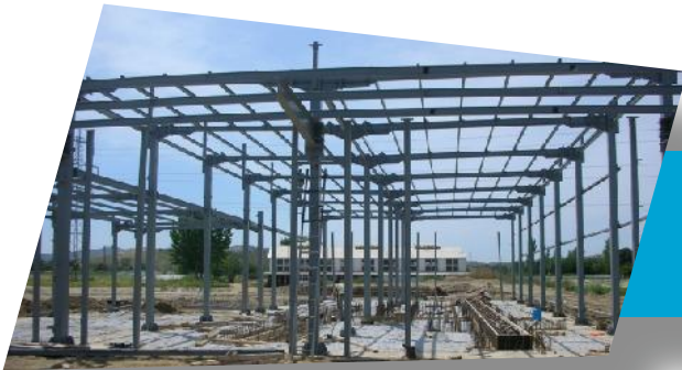
TüvTürk Steel Construction Vehicle Inspection Stations